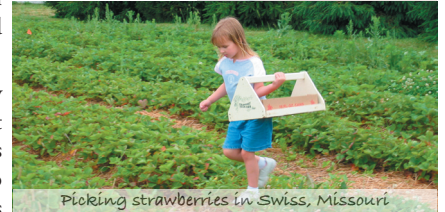
Picking strawberries in Swiss, Missouri