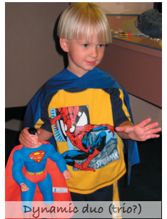
Dynamic duo (trio?)