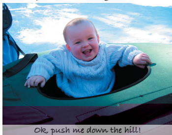
Ok, push me down the hill!