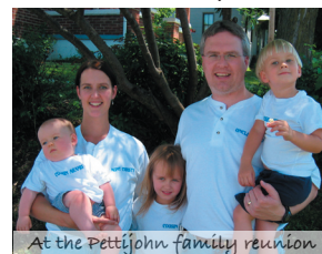
At the Pettijohn family reunion